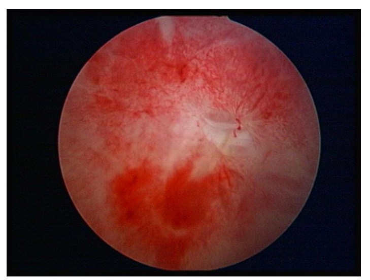
Fig 1 Hunner Lesion

A Hunner lesion is <u>not an ulcer</u> but an inflammatory infiltrate. The finding of a Hunner lesion has been somewhat subjective.